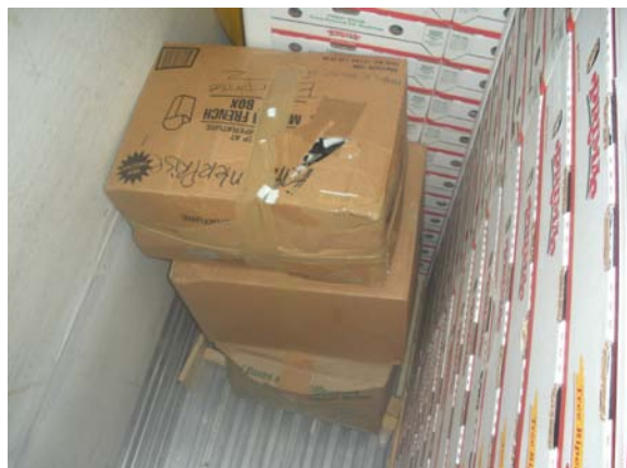
Boxes hidden behind stacks of Peaches